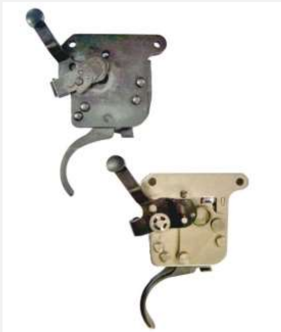
The standard Remington 700 trigger group (L/H) and x pro trigger group are explained to the student