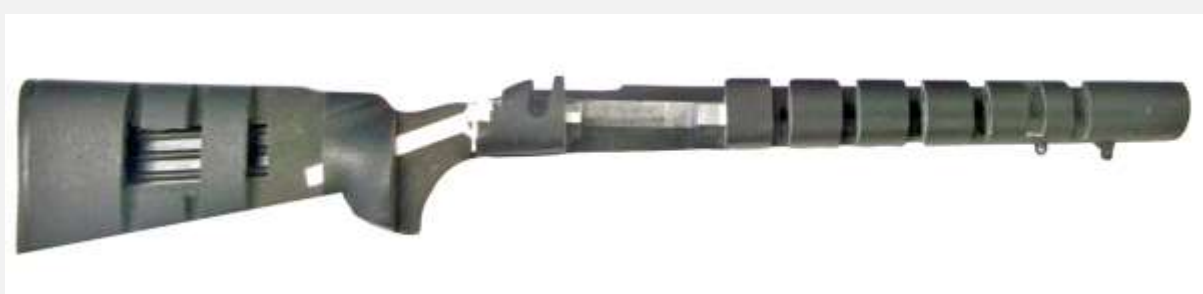
The Remington stock, made by HS precision, sectioned to show the strengthening alloy inserts moulded into the stock for rigidity