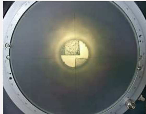
Magnification showing overlap of gear engagement