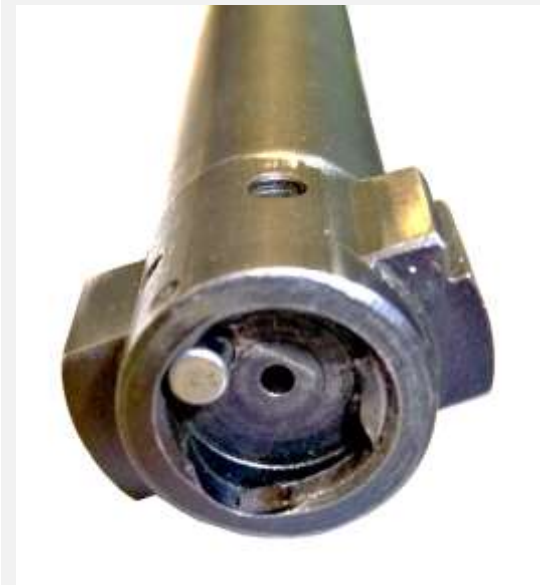
Remington bolt head with ejector and extractor fitted.