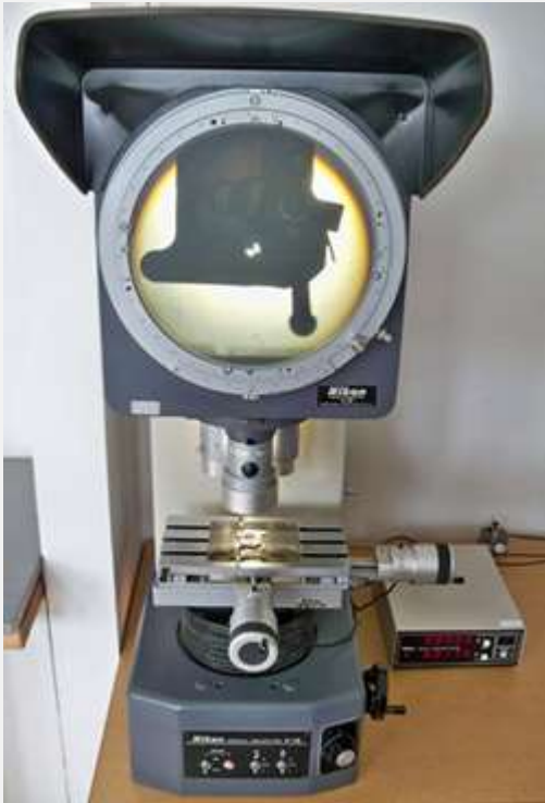
Modern comparator with digital readout