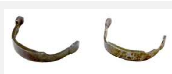
Remington rivetless extractor showing new and used