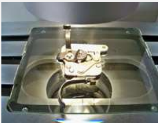
Trigger group placed on the comparator table