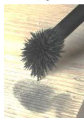
An example of the wand in action!