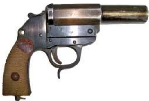
Ref 25 German military alloy signal pistol, 1943