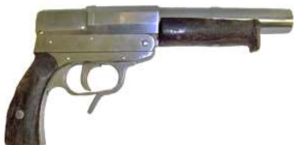
Ref 21 Signal pistol AC43 aircraft 26.5mm