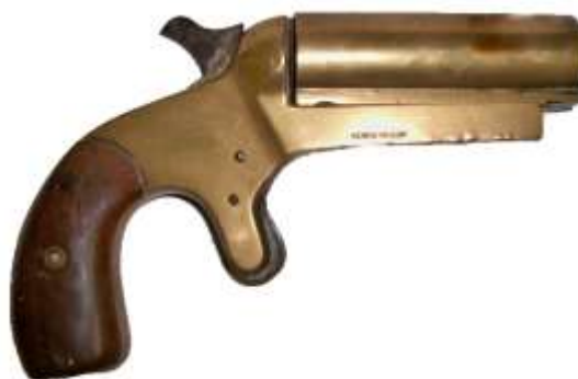
Ref 36 Dyer & Robson London verys patent