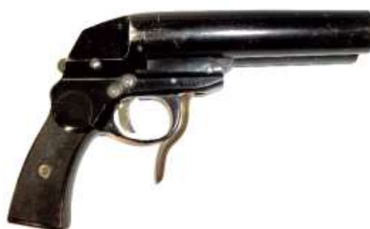
Ref 10 1941 German model "L" double barrel flare pistol