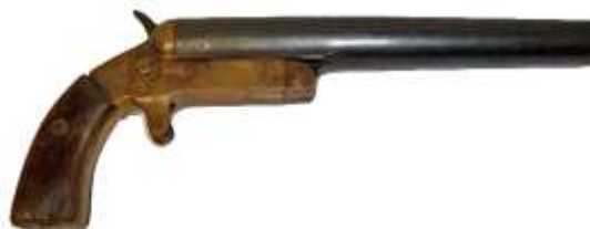
Ref 12 Remington Arms Co. Mark 3 signal pistol