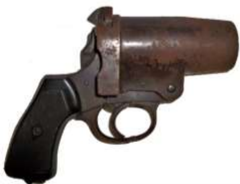
Ref 35 Webley & Scott No 3, mark I (1939)