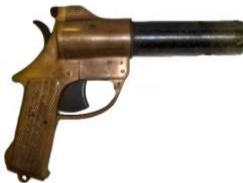
Ref 14 International Flare Signal Co. Ohio, Aug '43