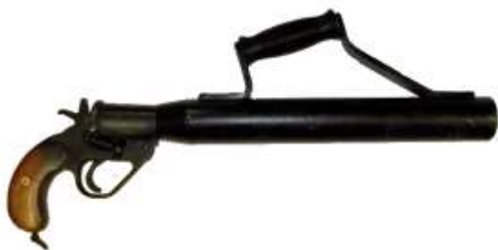
Ref 45 SPRA line thrower