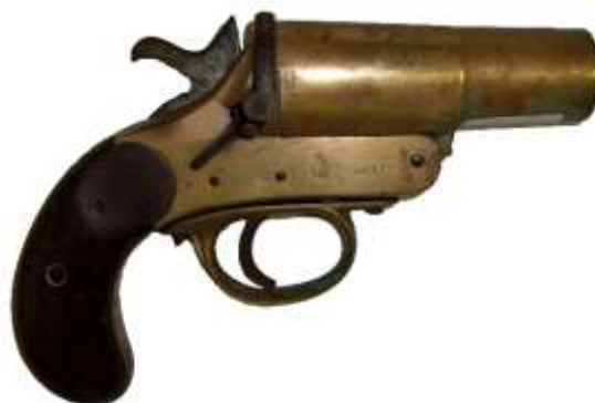
Ref 42 Webley & Scott Ltd WW1 flare pistol