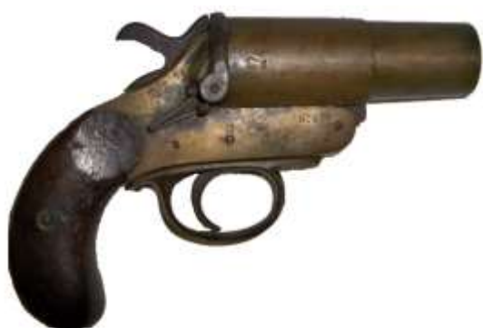
Ref 39 Webley & Scott Ltd flare pistol