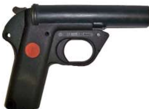
Ref 34 H&K 26.5mm signal pistol Model P2A1