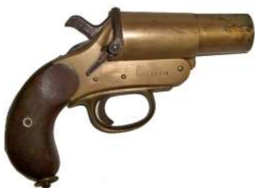
Ref 33 Cogswell & Harrison London signal pistol