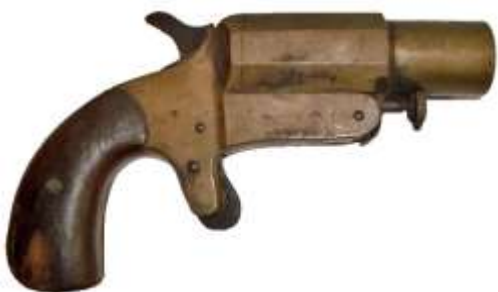
Ref 05 1" signal pistol