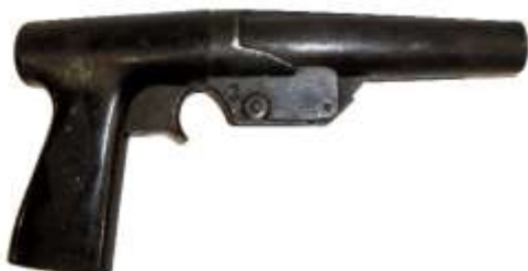
Ref 11 USN signal pistol mark 5 R F Sedley inc. 1942