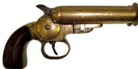
Ref 24 German Imperial Navy signal pistol, Model 1899, manufactured by Werft Kiel Navy Yard