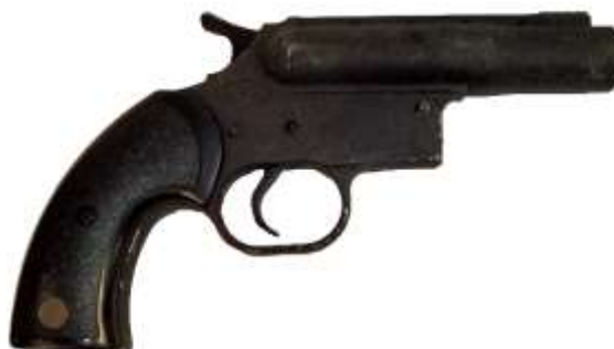
Ref 08 SAPL signal pistol