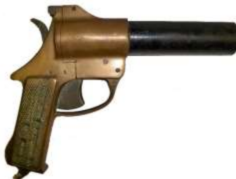
Ref 32 International Flare Signal Co. Ohio, Aug'43