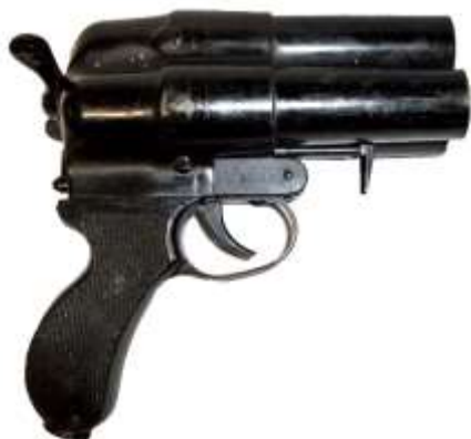
Ref 09 WW2 Japanese Navy type 90, three barrel flare pistol By Kayaba Kogyo.k.k. second variation