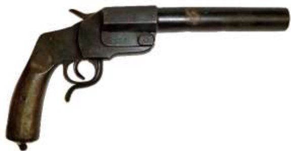
Ref 37 WW1 German signal pistol