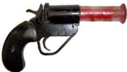
Ref 15 WW2 signal pistol Webley Pattern