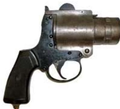
Ref 46 Webley aircraft signal pistol No 4, mark I