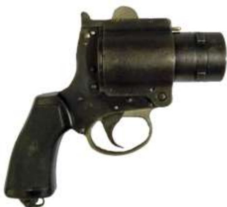
Ref 27 Webley & Scott Model M flare pistol