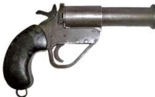
Ref 16 WW2 signal pistol No 1. M+S, Webley Pattern