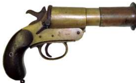
Ref 18 Webley & Scott Ltd, MK III British Army WW1