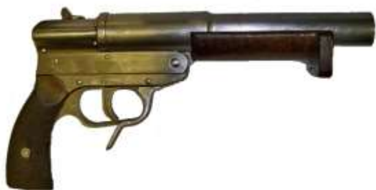
Ref 31 Walther Kriegsmarine stainless steel flare pistol, double barrel, 1936