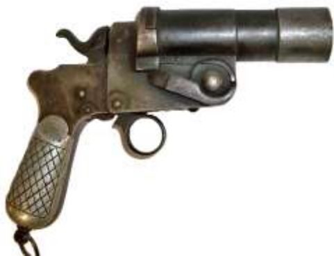
Ref 07 Castelli Brescia signal pistol