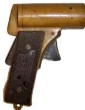
Ref 04 International Flare Signal Co. pistol pyrotechnic - M2