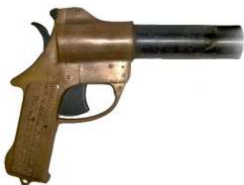
Ref 23 International Flare Signal Co. Ohio, Sept '43