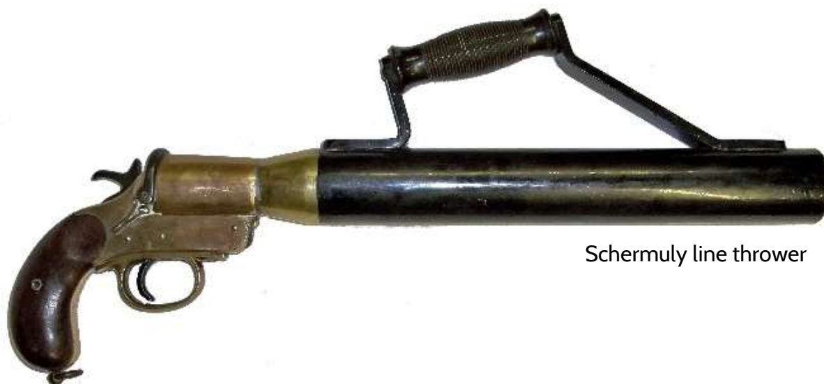
Schermuly line thrower