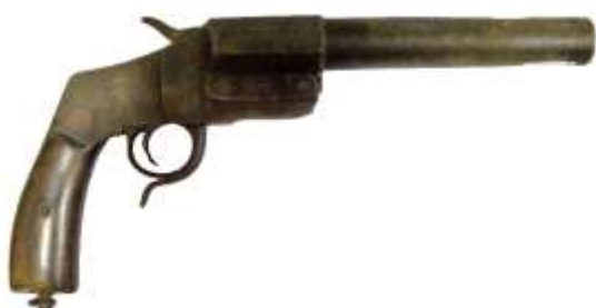
Ref 29 WW1 German Hebel signal pistol