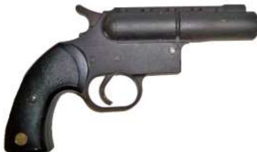
Ref 38 1" flare pistol