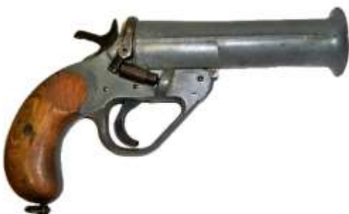
Ref 17 WW2 signal pistol Webley Pattern