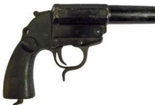
Ref 28 German military alloy signal pistol, 1940