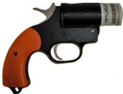
Ref 41 Olin Winchester 25mm signal flare launcher