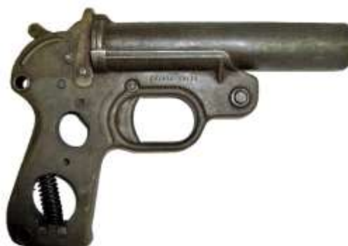
Ref 22 German signal pistol