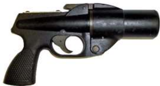
Ref 44 Webley-Schermuly signal pistol