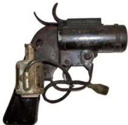
Ref 01 1942 pyrotechnic M-8