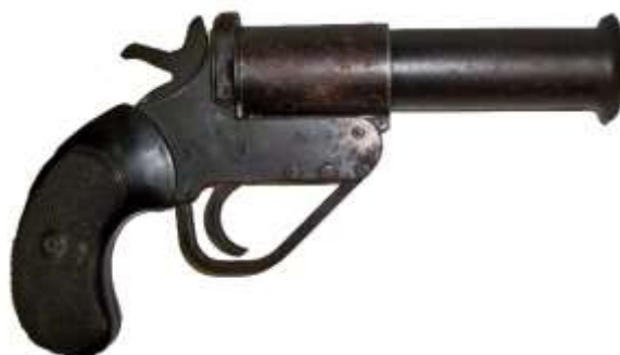
Ref 40 British WW2 1" steel signal pistol