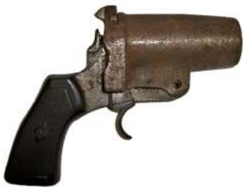
Ref 13 Webley & Scott Ltd Birmingham No 3, Mark I signal pistol