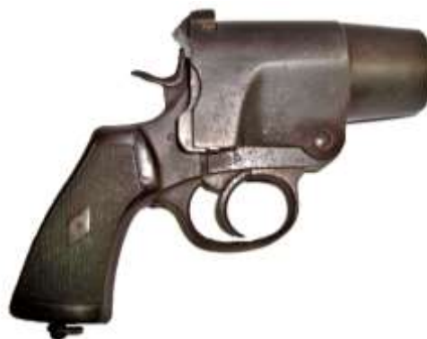
Ref 20 Webley & Scott No 2. Mark I