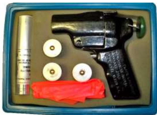
Ref 47 25mm flare launcher for marine signal purpose, mark XXV Olin - East Alton ILL