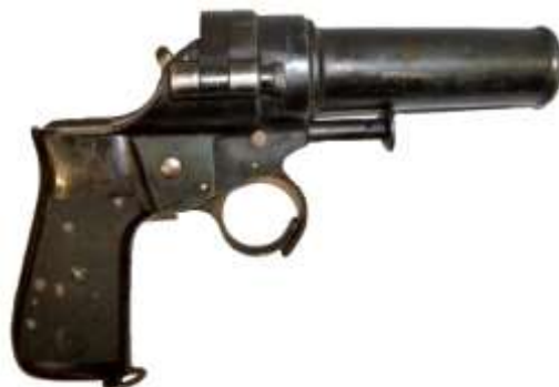
Ref 02 Ceska' zbrojovka AKC spol.v praze