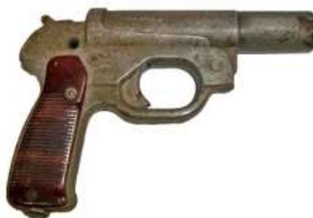
Ref 06 WW2 German LP-42 flare signal pistol