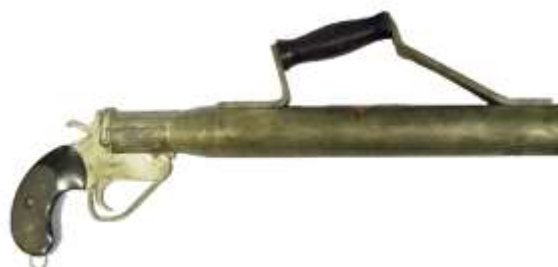
Ref 30 Schemuly line thrower