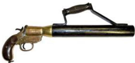
Ref 19 Schermuly line thrower