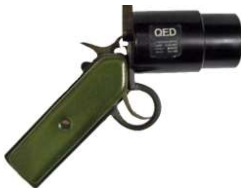
Ref 26 QED Borough Green, Kent, England