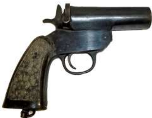
Ref 03 Harrington & Richardson arms co. Worcester Mass USA, Mark VI, 1"