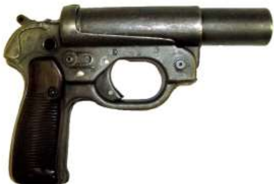
Ref 43 WW2 German signal pistol LP-42