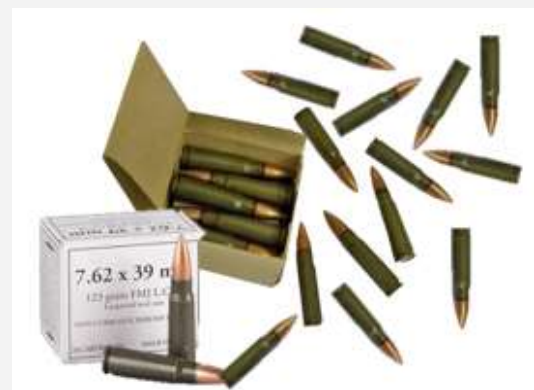
Are you issuing CIP approved ammunition?