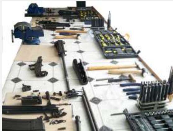
Stripping and assembly