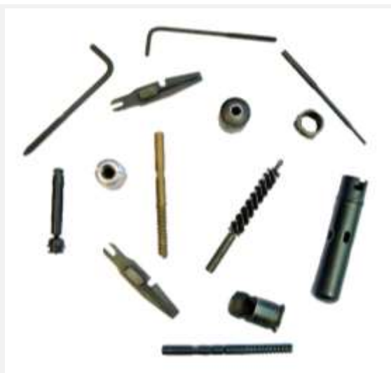
Armourers repairs can use tools from the manufacturer, or homemade tools