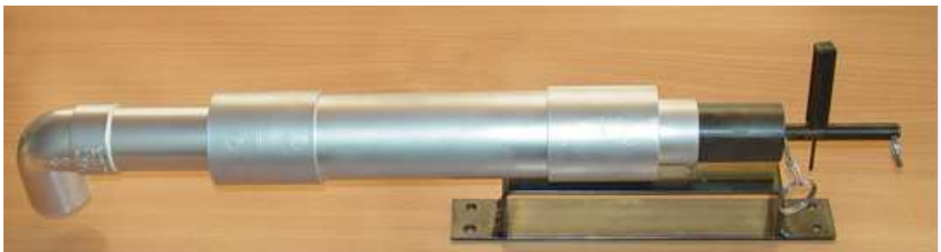
Shot gun and rimfire / blank holder