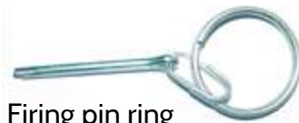
Firing pin ring code 76-072