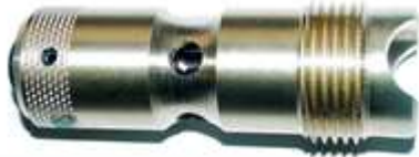
Pistol sleeve holder code 76-053