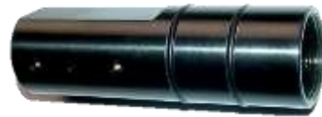
Body shot gun / blank code 76-081