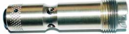
Rifle sleeve holder code 76-054