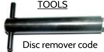
Disc remover code 76-070