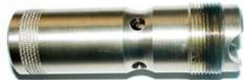
Rimfire / blank sleeve holder code 76-056