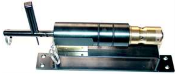
Shot gun / blank firing device code 76-052