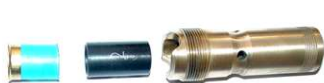
Shot gun holder