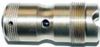
Shot gun sleeve holder code 76-055