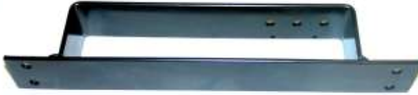
Body holder code 76-082