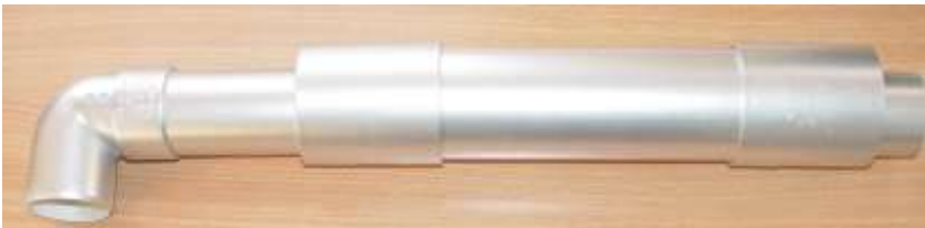
Silencer tube shot gun / blank code 76-084