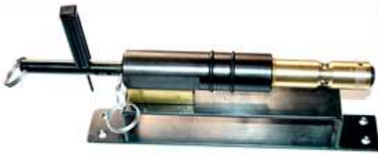
Small calibre firing device code 76-051