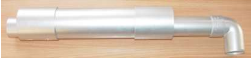
Silencer tube code 76-083