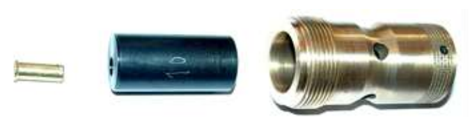
Rimfire / blank holder