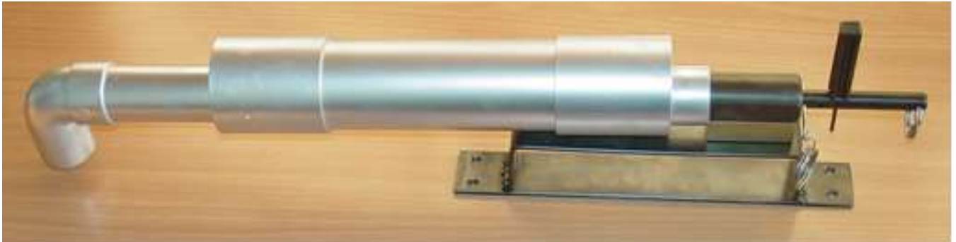
Small calibre firing device pistol / rifle

Designed to be used for firing primed cases, it removes the need to maintain a wide range of firearms of different calibres with all the security, cleaning and maintenance implications involved.