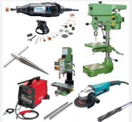
Various tools and equipment can be used to reactivate firearms, so that they can be used again. Forensic evidence can be found this way