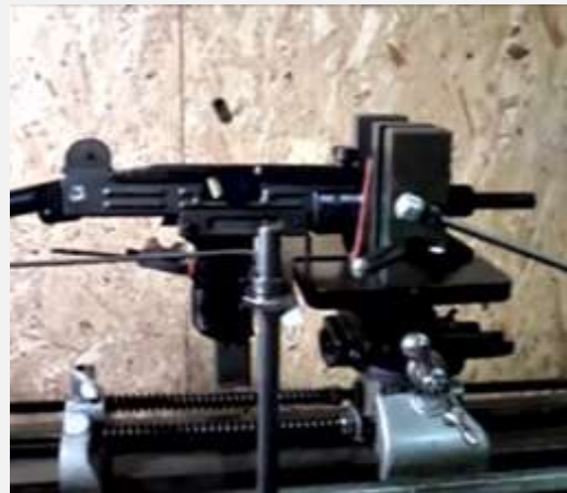
UZI submachine gun test fired in "full auto" mode firing 600 rounds per minute