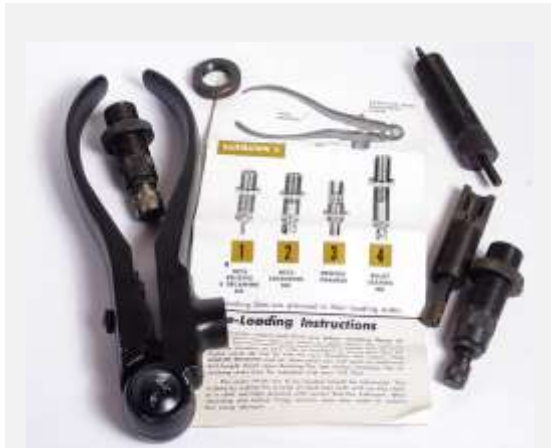
Simple tools for hand loading