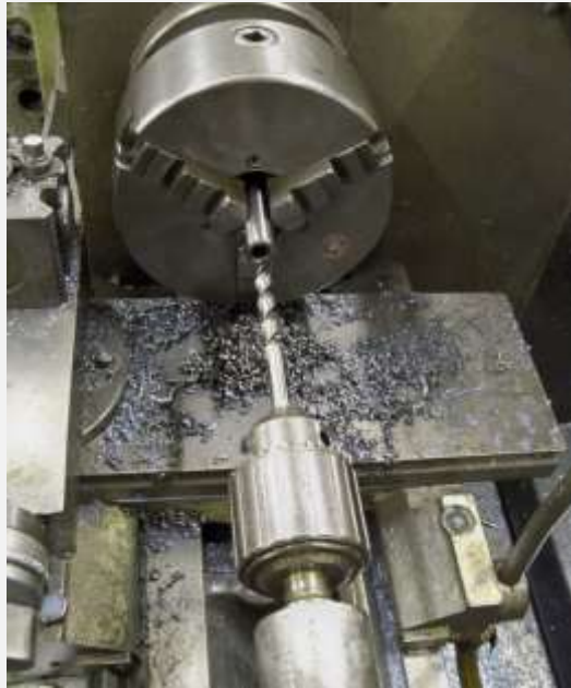
Manufacturing an improvised barrel can be achieved in any well-equipped workshop/factory