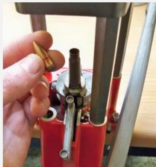
Re-loading AK47 ammunition by the student prior to test firing