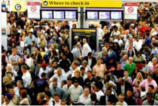
Simple solutions for enhanced concourse protection against bullets, blast or bomb fragments