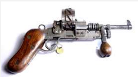
Homemade firearms can be sophisticated or crude