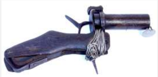
An improvised weapon seized from an individual in Nepal