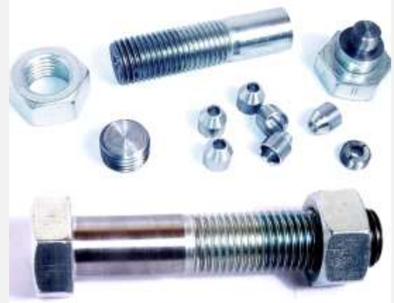
A disguised silencer to fit the “nut & bolt” shown above