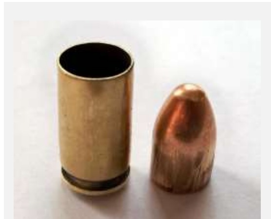
9 mm bullet and cartridge case recovered from the scene, what can they tell us?