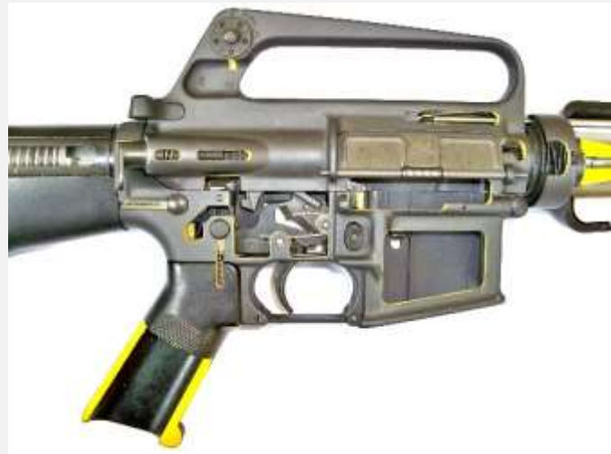
Methods of operation, how does the weapon function?