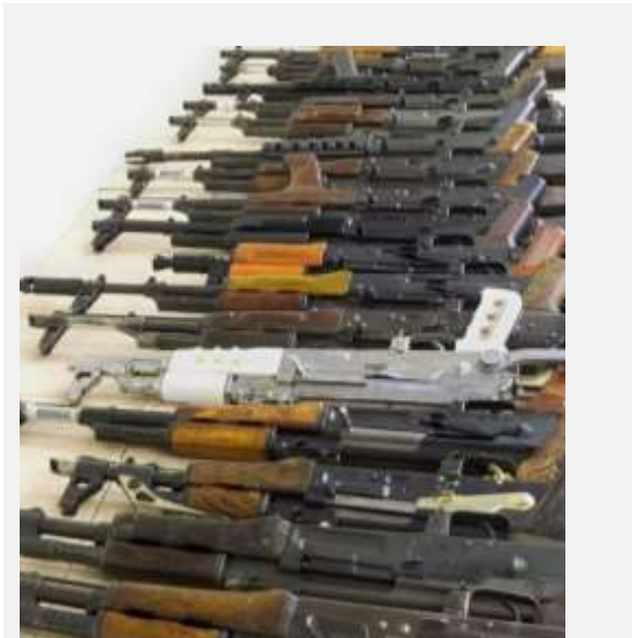
AK47 assault rifle and variants available in most countries with over 20 countries currently producing, estimate of over 75 million produced (one for every 60 people on earth)