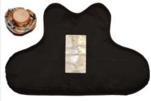
Soft armour, AA manufactured super lightweight body armour that is able to stop the 9 mm/ .357/ 44 magnum bullets