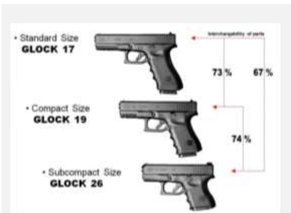
Glock pistol showing interchangeability of parts