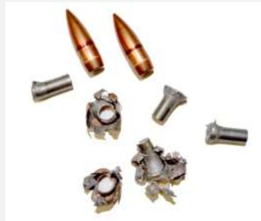
AK47 steel core bullets before and after hitting the new material AA processed as shown above