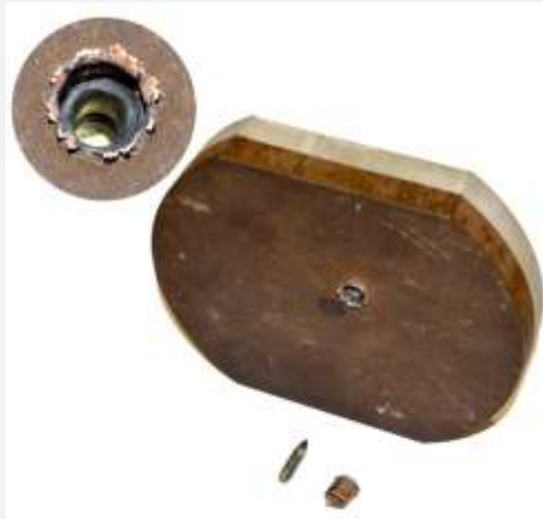
30 mm thick steel and alloy material unable to stop the M2AP bullet