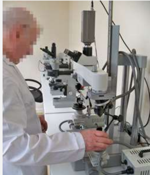
Matching bullets to the gun that fired them requires the use of a comparison microscope