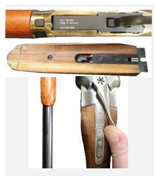
Some parts need to be removed, turned over or manipulated to find the serial number

Serial numbers in various locations on different firearms. Some have NVN recorded in the register, occasionally proof mark numbers are mistaken for serial numbers