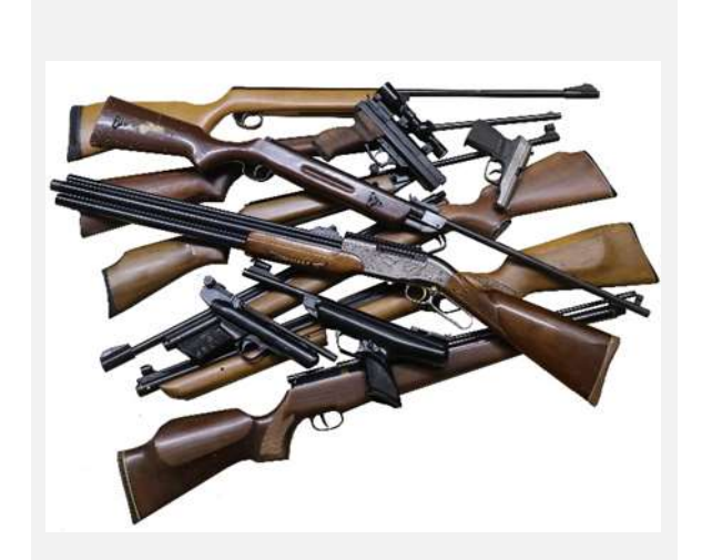
Air gun types, legal limits, section 1, 5, is it loaded? How does it operate? A range of air rifles and pistols will be available for examination, with instructions on how to handle them