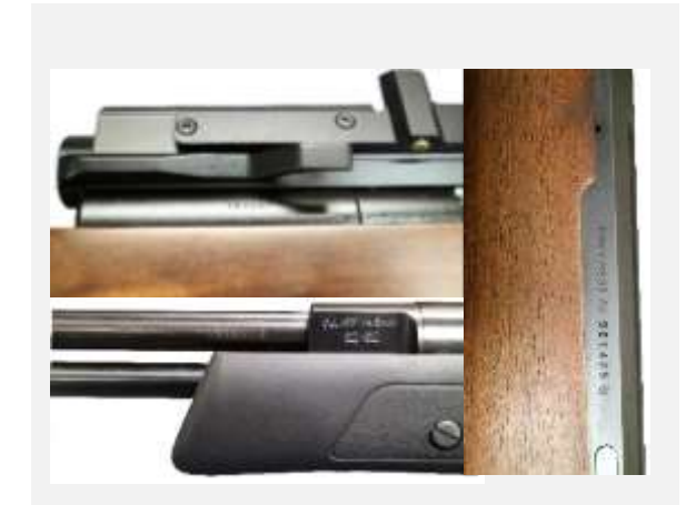
Serial numbers in various locations on different firearms. Some have NVN recorded in the register, occasionally proof mark numbers are mistaken for serial numbers