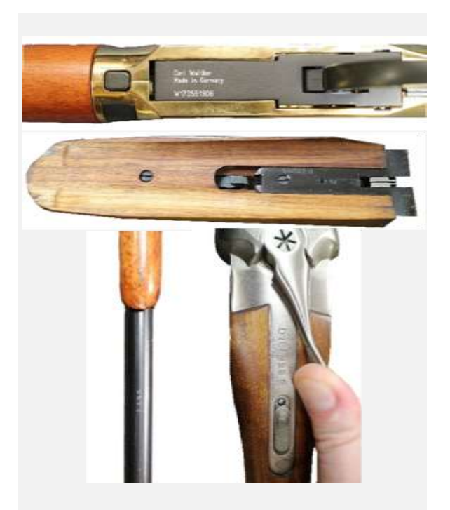
Some parts need to be removed, turned over or manipulated to find the serial number