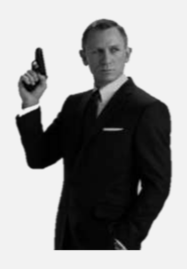
Gun handling skills are required when examining to make sure the weapon is safe to handle, you are expected to know how to check a weapon is safe and where to look for serial numbers