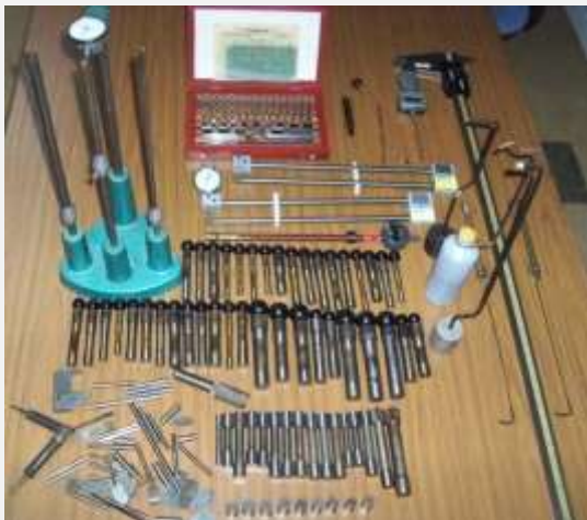
Gauges, you need to understand how to use them