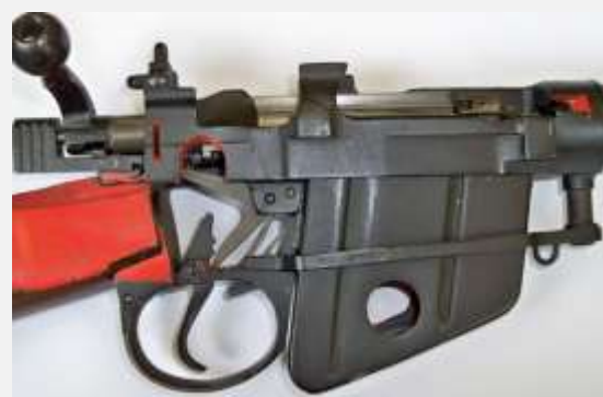
Trigger pull regulation is for the expert, trigger pull weight, sear engagement, correct function of the safety catch must be checked before a gun is offered for sale