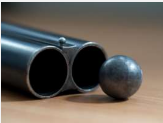
Firing solid shot, or steel shot through heavily choked shot guns can damage the barrel