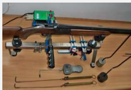
Trigger pulls can be measured in various ways, customer safety is the overriding responsibility of the RFD!